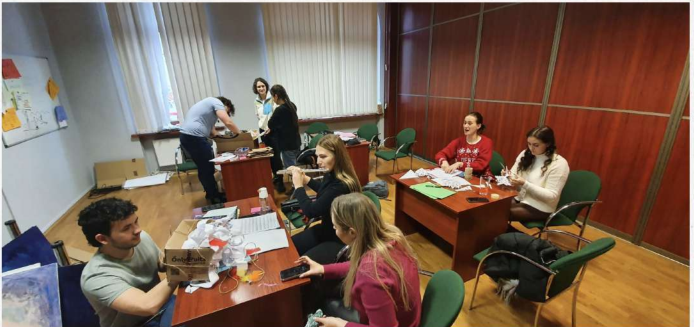
During the workshop on coaching